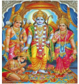
Rama-Sita With Hanuman and Lakshmana The Perfect Being

Apadam apahartaram Dataram Sarva Sampadam Lokabhiramam Sri Ramam Bhuyo Bhuyo Namamyaham