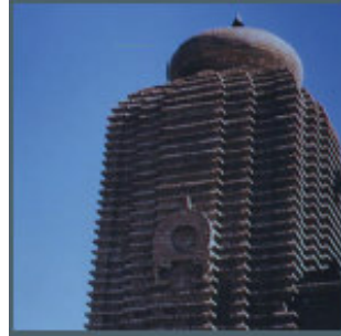
Shiva Shrine (Kalinga Style)