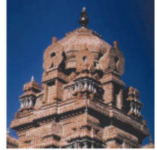
Vishnu (Chola Style)