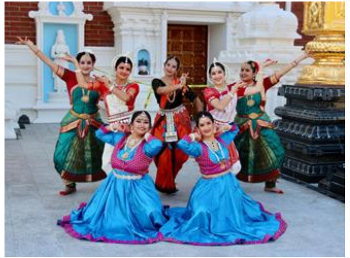
Dances of India