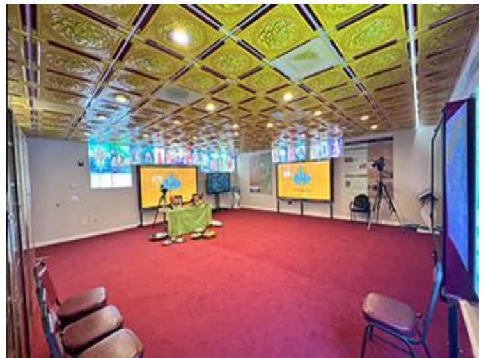
Hindu Heritage Hall