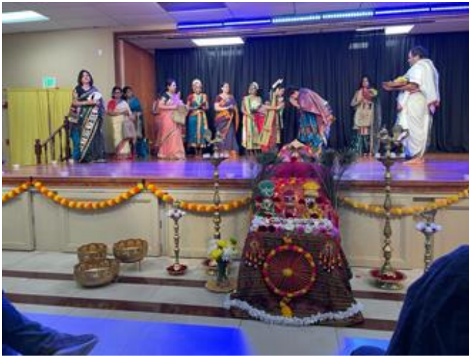
Dances of Orissa