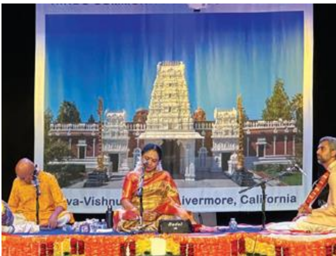
Sudha Raghunathan concert