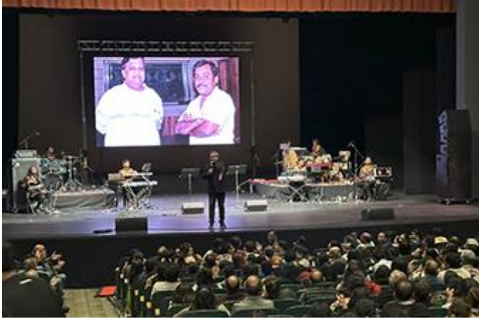
Simply SPB show