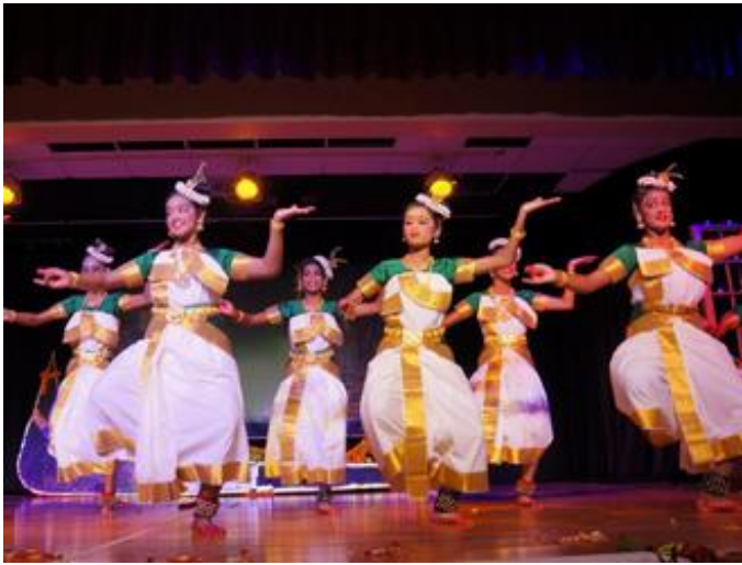
Sundara Kerala continued