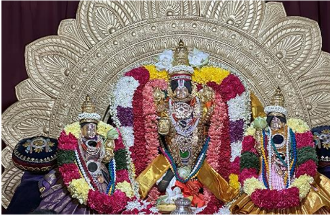
San Ramon Kalyanvotsavam