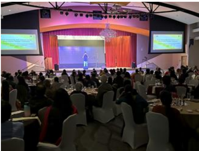
Annual banquet Dinner