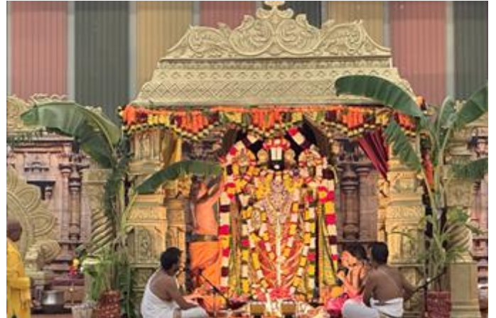
Evergreen High School Kalyanvotsavam