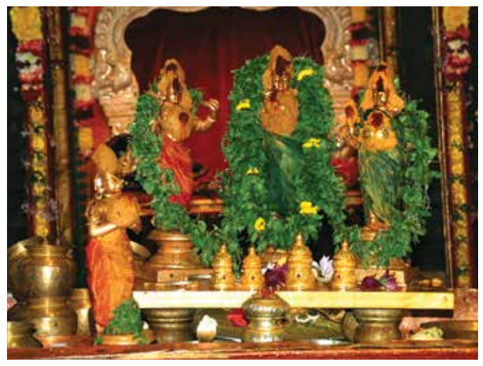
Sri Rama Navami