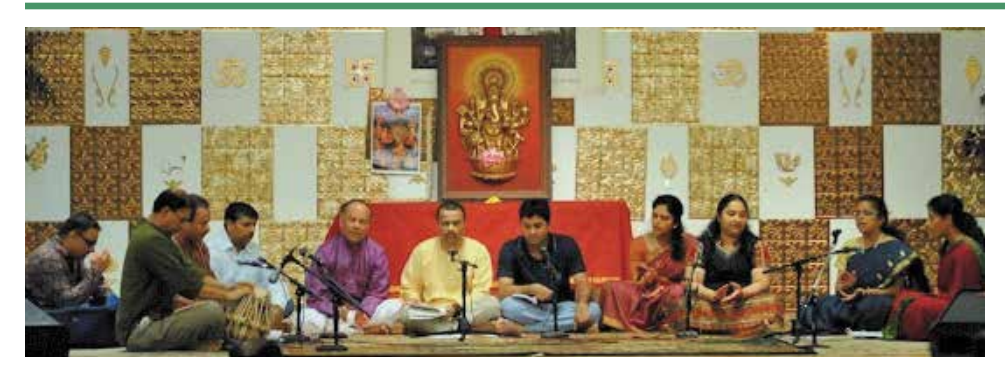
Cultural Program - Shri Haridasa Day