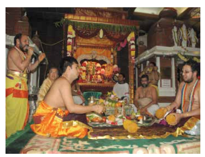
Sri Rama Navami Celebrations