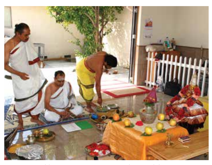
Goddess Saraswati Utsava Murthy Mandala Puja