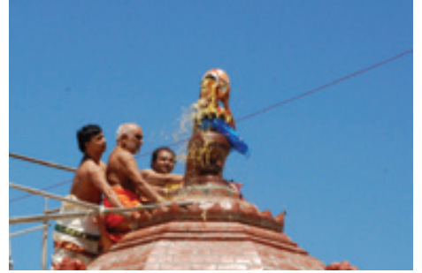
Vishnu Gopuram Maha Samprokshana