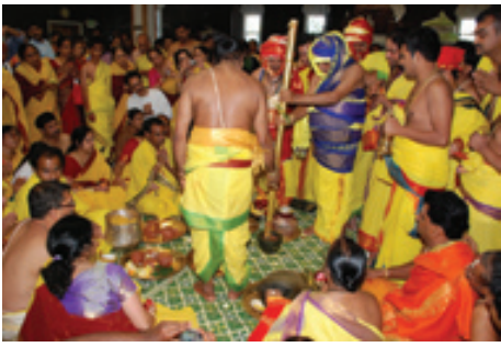
Ashta Bandhana Preparation