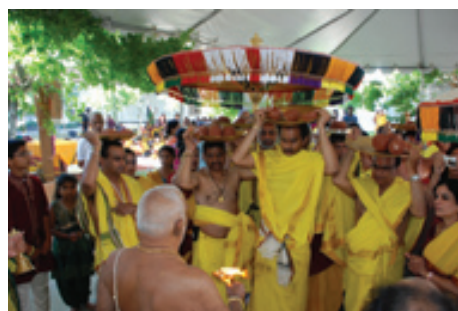
Ashta Bandhana Procession