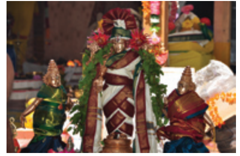
Sri Venkateshwara Abhishekam