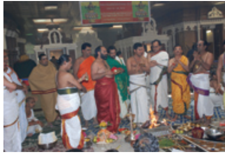
Maha Ganapathi Homam