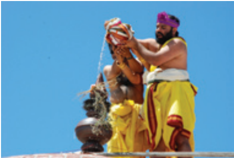
Shiva Gopuram Maha Samprokshana