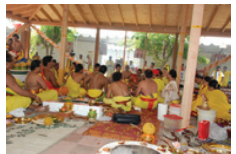
Durga Sukta Homam