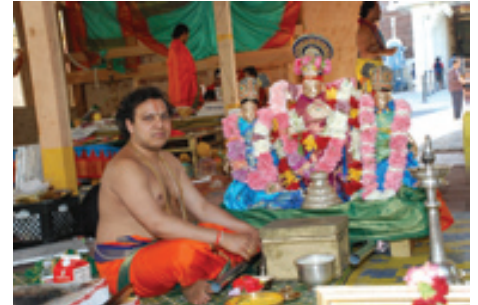
Samoochika Sri Satya Narayana Swami Puja