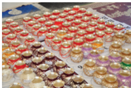
Shaanti Abhishekam with shasra Kalasha's