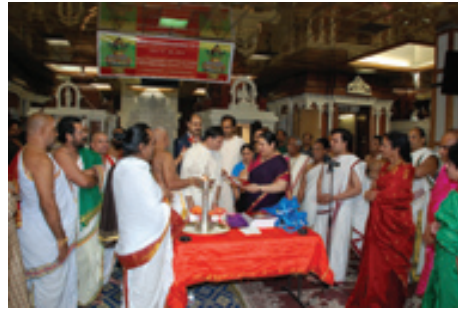
Consul General Souvenir Release