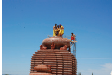
Shiva Gopuram Maha Samprokshana