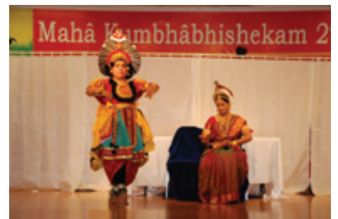
Jambavathi Kalyanam Yakshagana