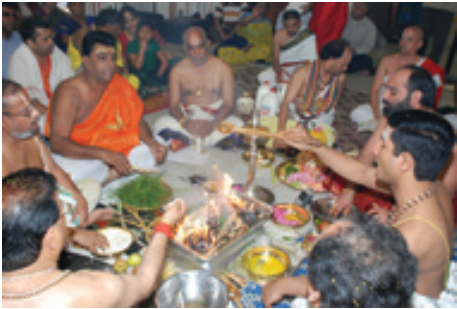
Maha Ganapathi Homam