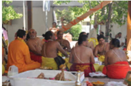
Maha Shanti Homam