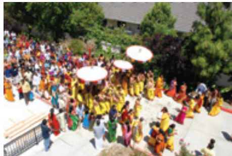
Utsava Murthy Procession