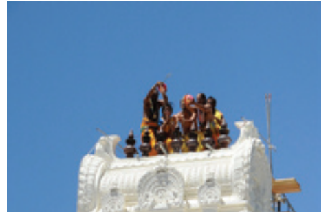
Maha Dwaram Maha Samprokshana