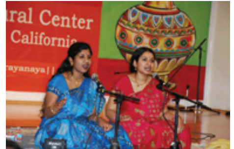
Hyderabad Sisters Vocal Concert