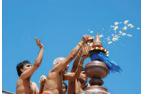
Vishnu Gopuram Maha Samprokshana