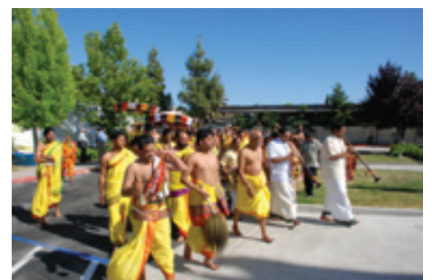
Ashta Bandhana Procession