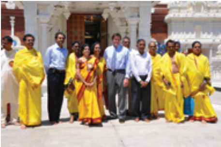
Congressmen John Garamendi's Visit