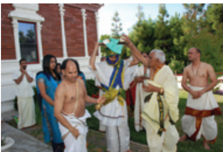
Balalayam Bhoomi Puja