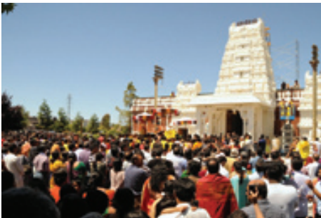
Maha Dwaram Maha Samprokshana