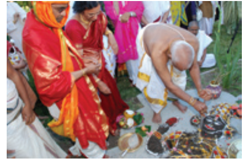
Yaagashaala Bhoomi Puja