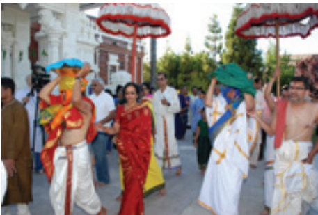
Yaagashaala Bhoomi Puja