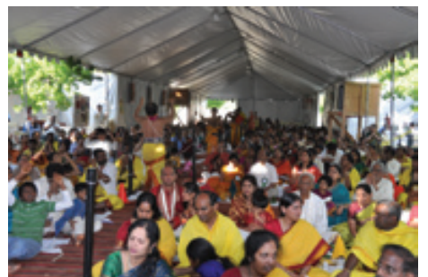
Samoohika Sri Satya Narayana Swami Puja