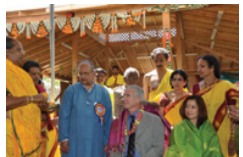
Senator Tom Torlakson's Visit