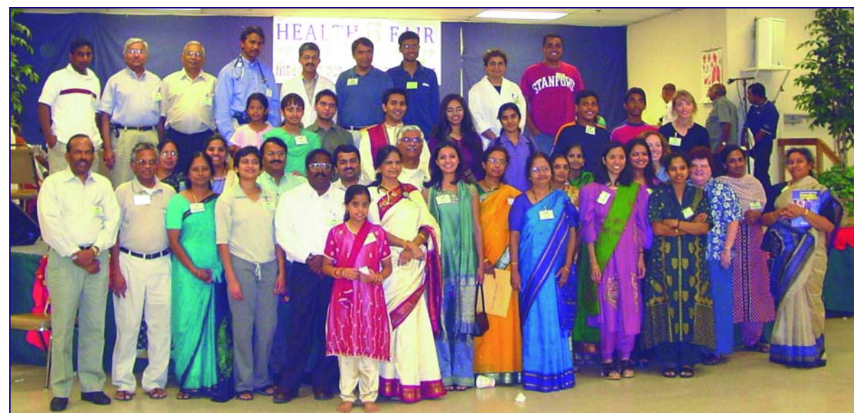
Some of the volunteering physicians, medical professionals and other volunteers participated in the Health Fair