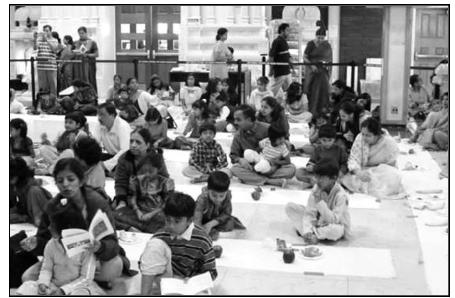
Children performing Samoohika Ganesha Puja

The day concluded with a three hour Cultural Program that was very colorful with various performances by children to a packed Assembly Hall. Children's groups from various Bay area organizations and groups from our temple participated in the