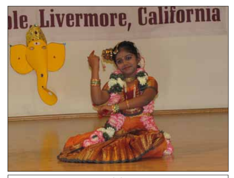
Guru Shishya Day