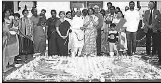
Shivaratri – Jyothirlinga lighting