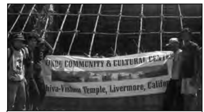
New huts under construction