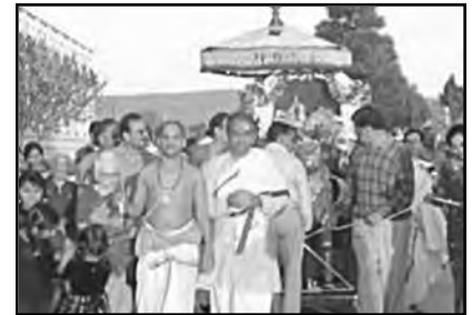
Brahmotsava - Procession

Shiva-Vishnu temple celebrated Shiva Brahmotsavam and Shivaratri festivals during the early part of March, with several devotees, Deeksha volunteers, priests, pachakas and office staff contribute to these annual events in full rhythm.. All in all, it was a holy and lively weekend on Mar 4th with a lot of activity and plenty of opportunity for the devotees to please Lord Shiva & Goddess Paravathi and other deities.