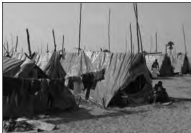
Displaced villagers in tents

Baskaran initially went to Muttakadu, a village 10 Km south of Kalpakkam that was affected by Tsunami.