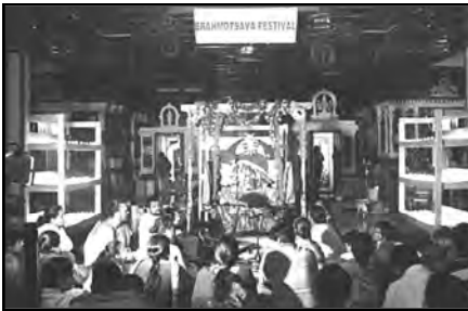
Brahmotsava- Sahsra Deepalankaranap