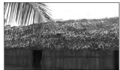
New huts ready for occupation