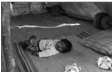
Living condition in the tent

Around 250 families lost their homes, fishing boats and nets and pretty much are living under the tents that were installed on the beach sand. There is no running water, no food, no vessels, no light and no sanitation. The image above is a portion of the village in their current living conditions. It was clear that the immediate needs were: