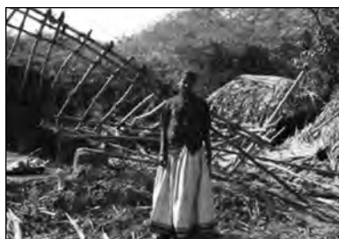
Only surviving girl in front of her hut

After distributing the rations, Baskaran also