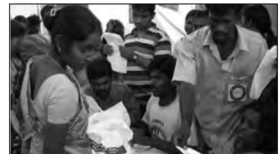
Volunteers distributing the rations