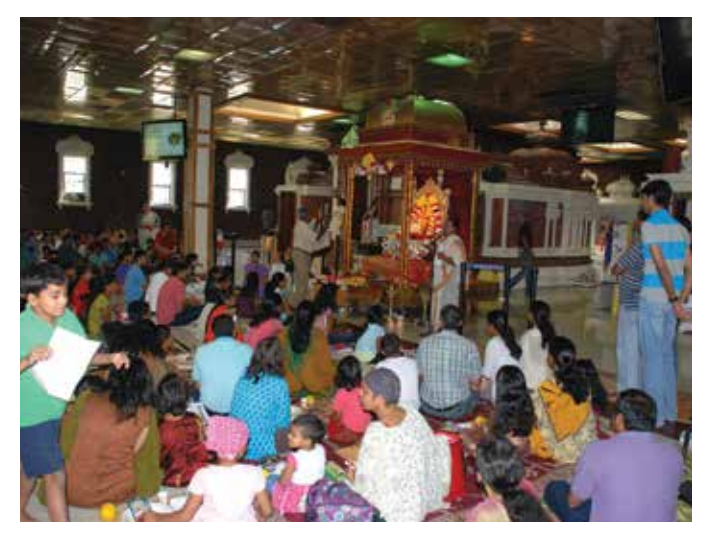
Back to School Saraswati Puja