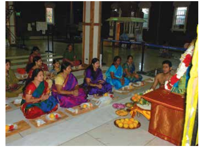
Swarna Gowri Vratam