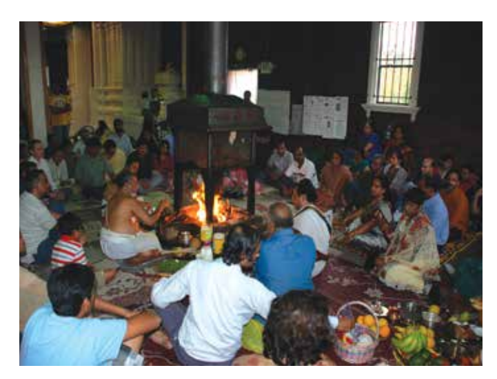
Sani Peyarchi - Nava Graha Shanti Homam