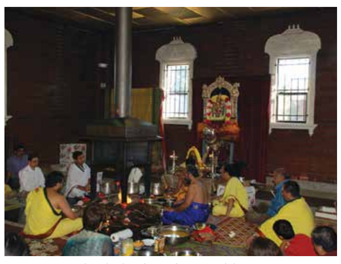
Ganesha Chathurthi - Sahasra Modaka Homam