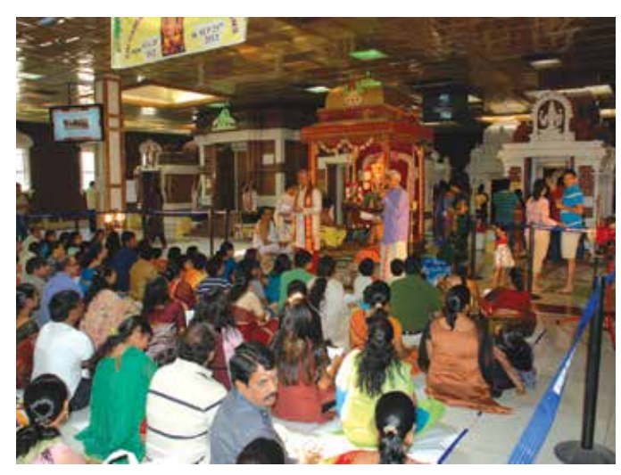
Sri Vishnu Sahasranama Parayanam