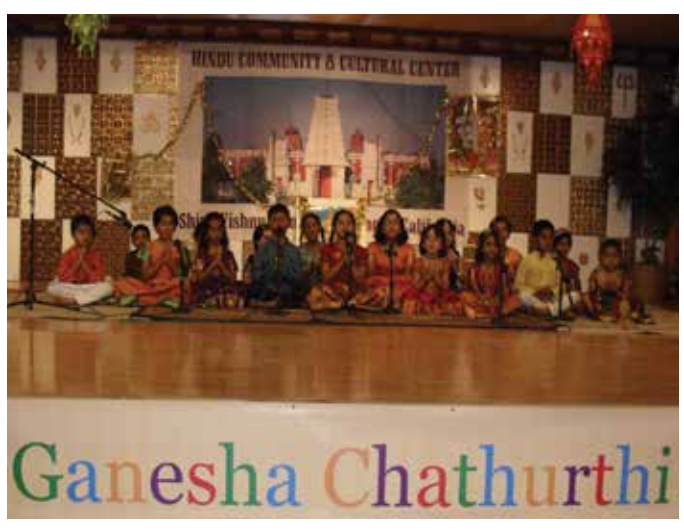
Ganesha Chathurthi - Program