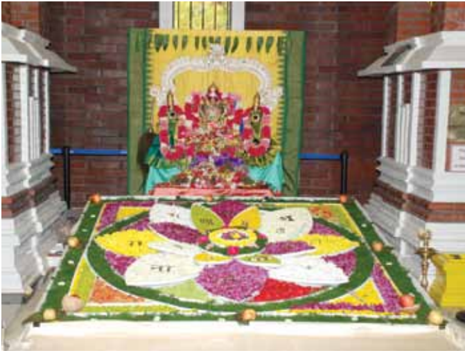
Sri Vari Pushpa Yagam