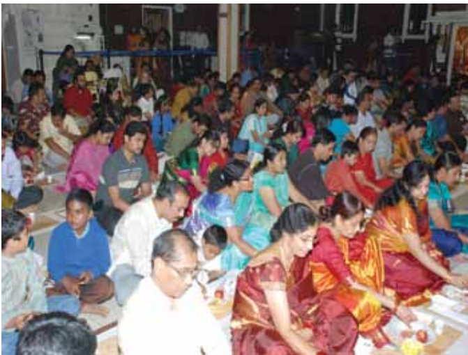
Sri Lakshmi Kubera Puja