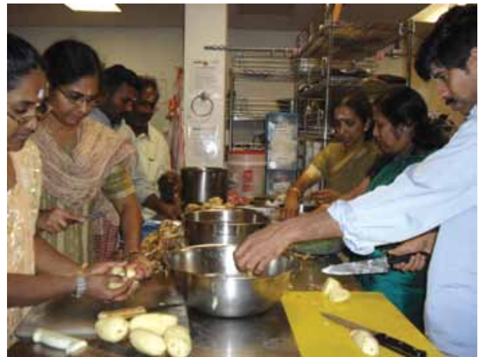
During Skanda Shashti