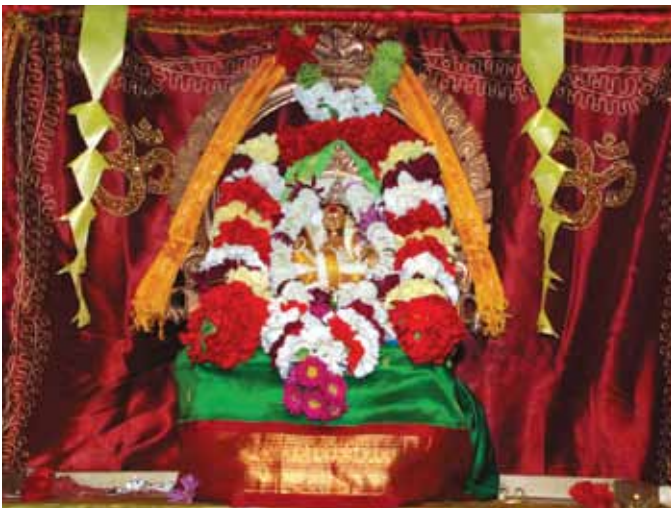
Sri AyyappaSwamy Puja