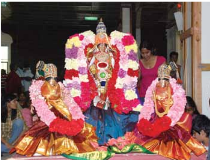
Sri Vishnu Brahmothsavam