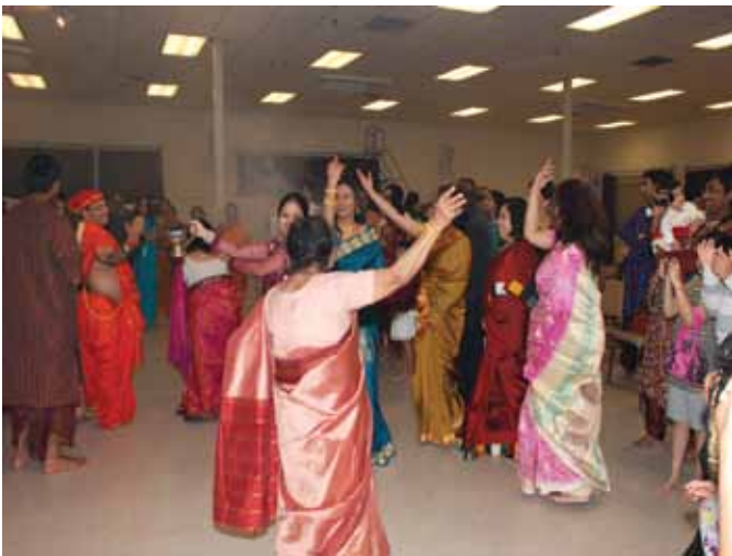
During Durga Puja