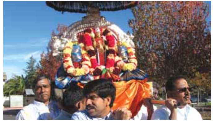
During Skanda Shashti