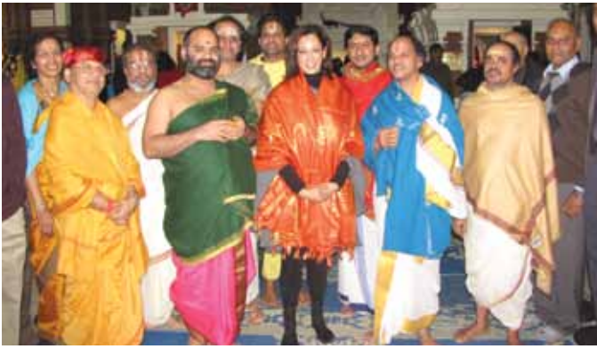
During Mrs. Kamala Harris Visit