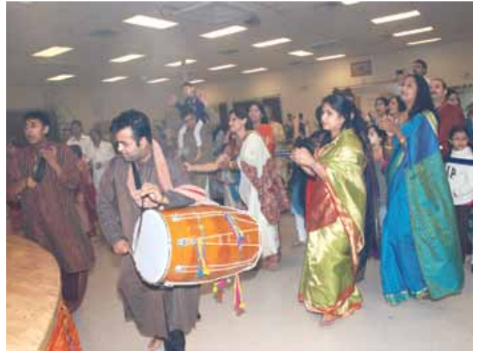
During Durga Puja