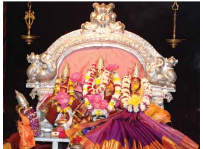
Sri Rama Punarvasu Abhishekam