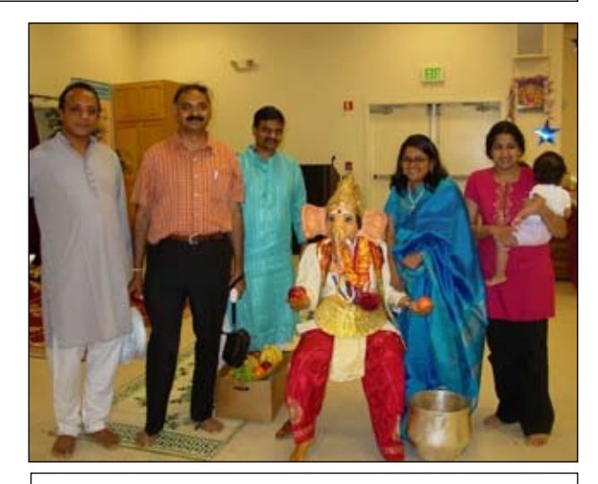
Surprise visit by Ganesha Claus