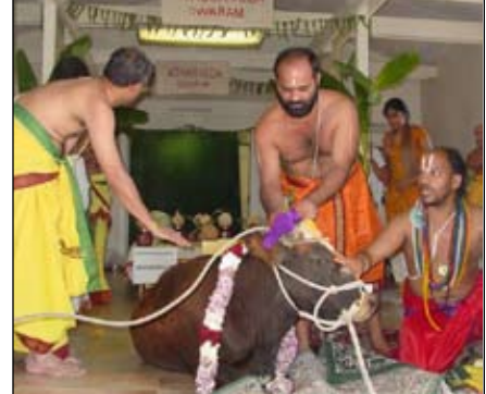
A rare opportunity to worship sacred Gomaata (cow)

function. The priests of Livermore temple have excelled one more time with their chanting of mantras while performing various rituals and homas for the four days and created a resounding effect and giving serene feeling to everyone. The sanctification of Utsava Murti occurred on Sunday, August 17 at 12:07 PM with the goddess viewing the holy cow and children. The program ended with Veda Parayana and procession of the