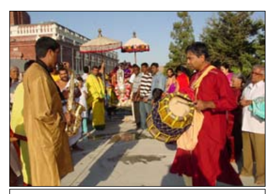
Goddess Kanaka Durga Procession in traditional style

The Kanakadurga Utsava Murti Samprokshana program took place from August 14 to August 17. The program was sponsored by 193 devotees and well attended by several hundreds of devotees. About 60 devotees took Deeksha and participated closely in the