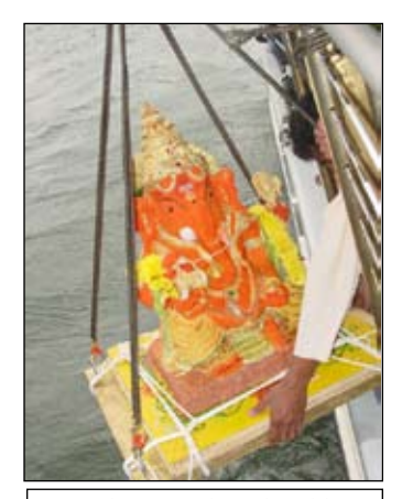
Devotees lowering Lord Ganesha's Idol in to bay waters