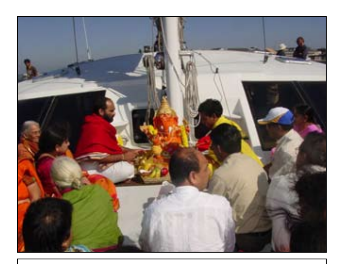
Temple priests performing Puja before Nimajjanam