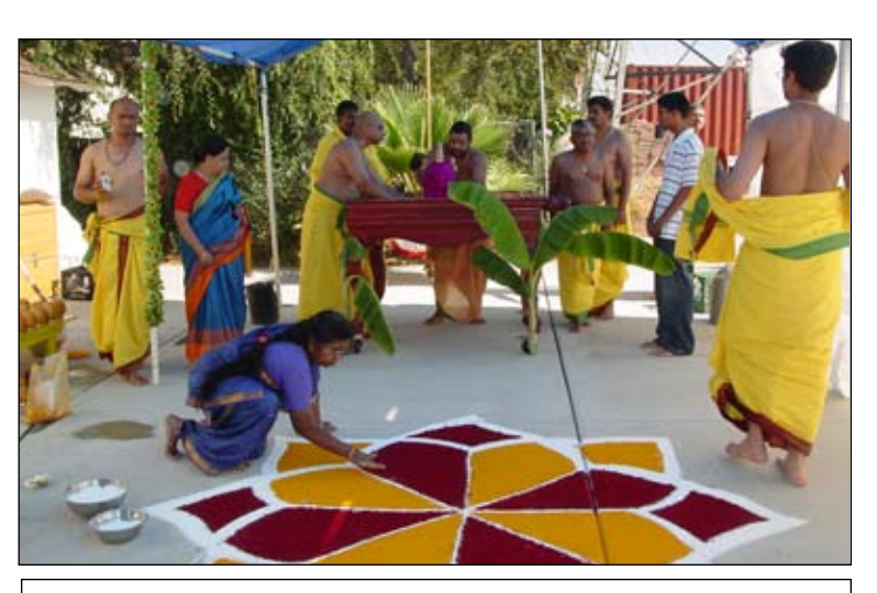
Devotee decorating place with beautiful Rangoli during Kanakadurga Samprokshanam