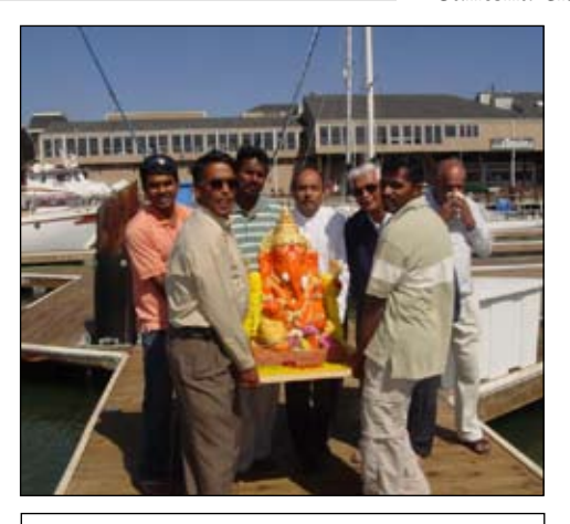
Devotees Transporting Ganesha idol to the boat