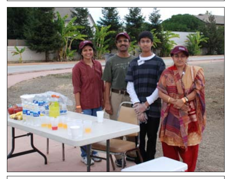
Volunteers distributing water bottles for the participants