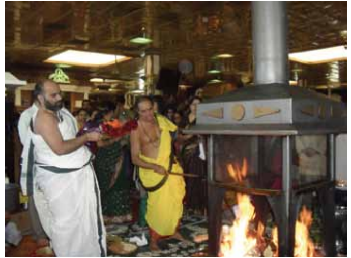
Poornahuthi 1008 Modaka Homam