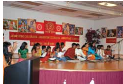
Sri Krishna Janmashtami Cultural Program