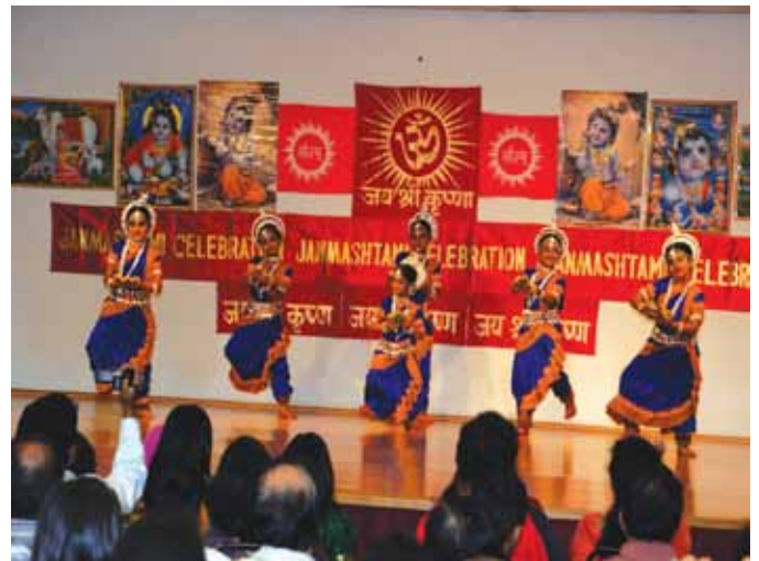
Sri Krishna Janmashtami Cultural Program