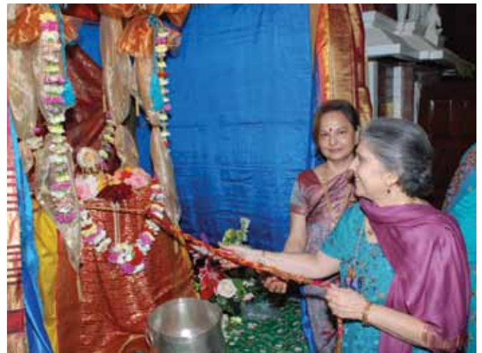
Sri Krsihna Janmashtami