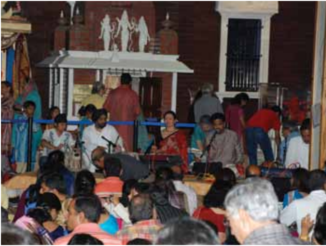
Sri Krishna Janmashtami Bhajans