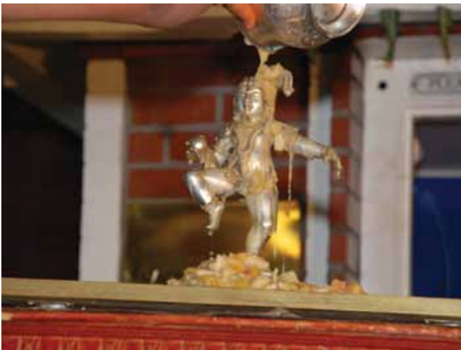
Sri Krishna Janmashtami Utsava Murthy Abhishekam