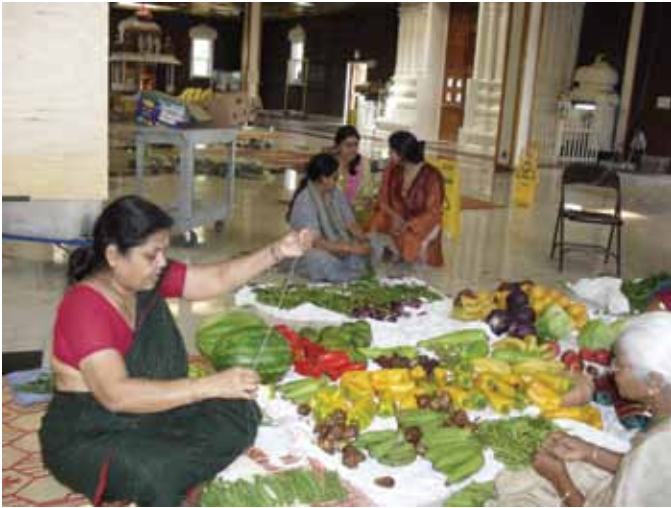
Shakambari Alankaram Preparation