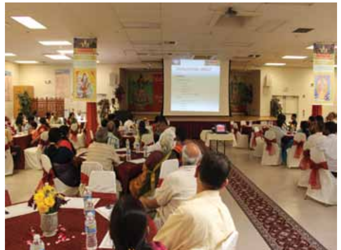
MKA 2010 Volunteer Appreciation