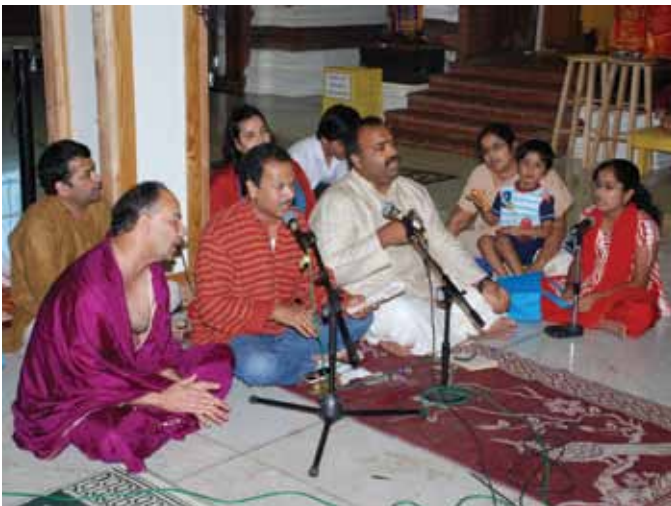
MKA 2010 - Mandala Puja - Sankeerthanam