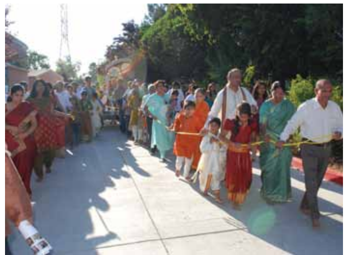
Ganesha Chaturthi Procession