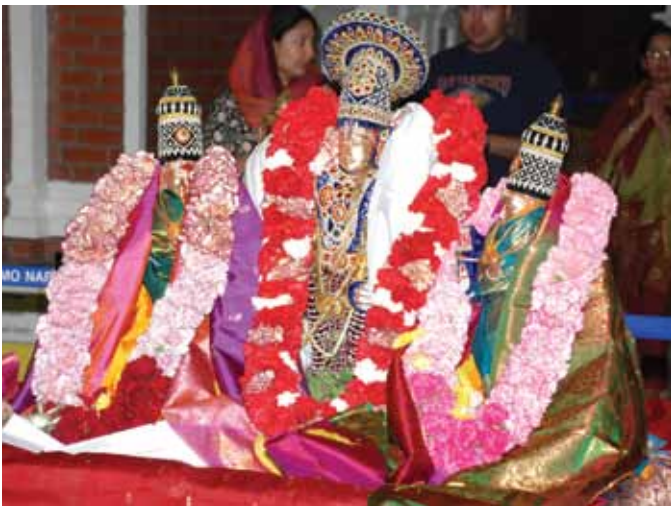
MKA 2010 Mandala Puja - Balaji Sri Devi Bhoo Devi Kalyanam