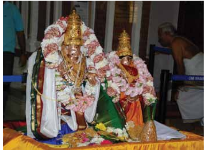
MKA 2010 Mandala Puja - Shiva Parvati Kalyanam